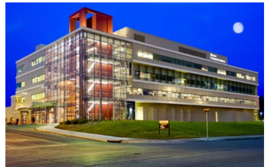
University of Missouri Health Care, Orthopedic Institute Microhospital